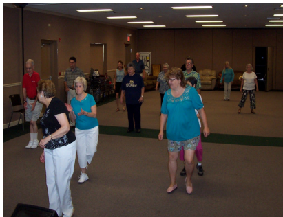
Ready, set, here we go!